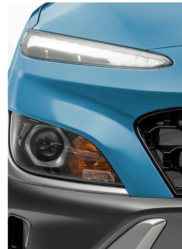
LED daytime running light