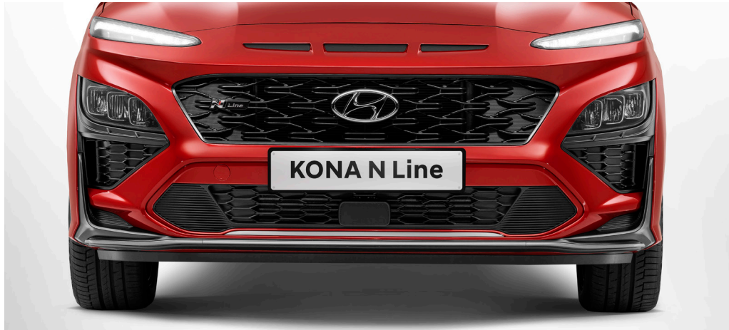
Sleek front grille