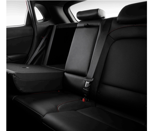
60/40 Split seats with centre arm rest