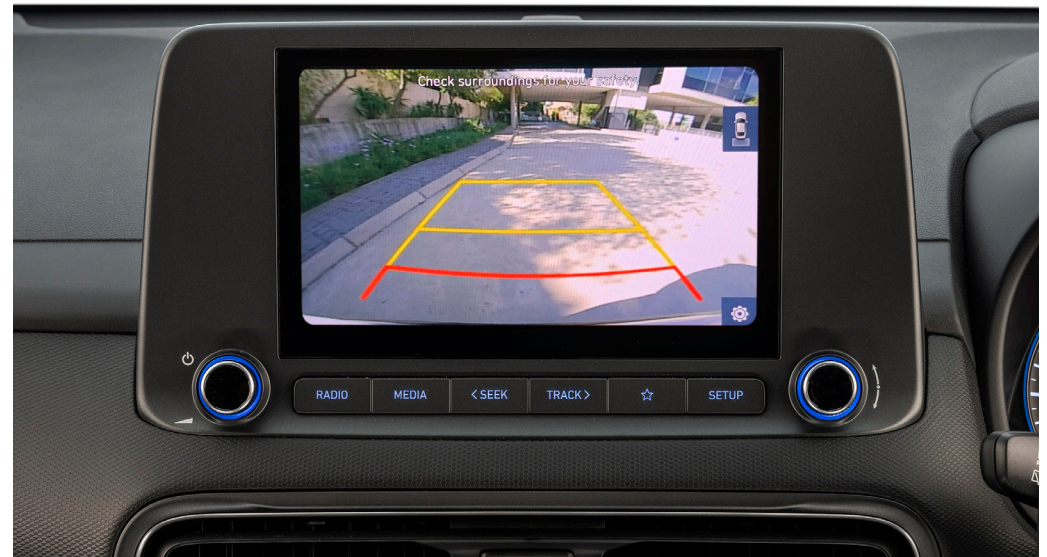
Rear view camera