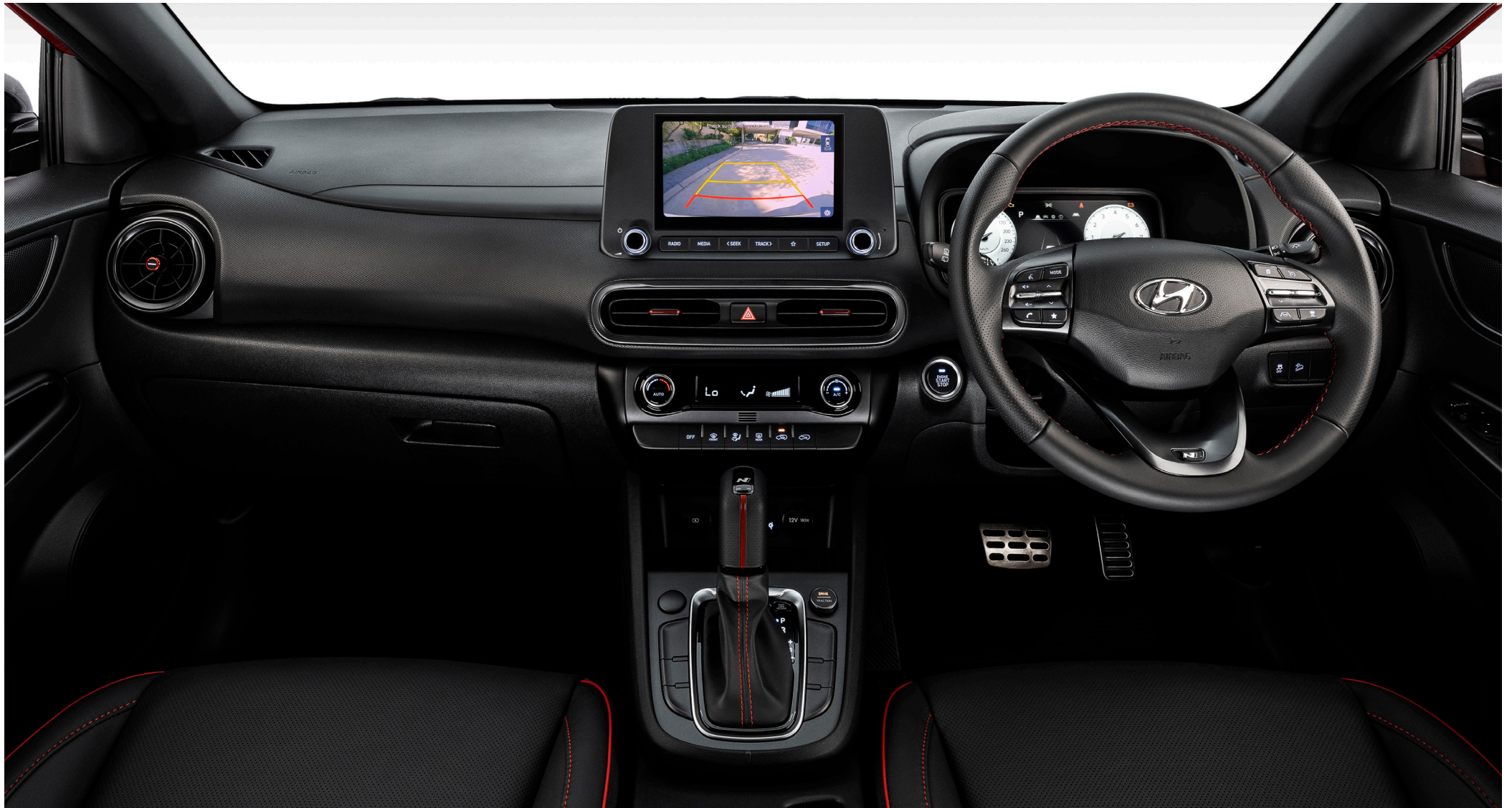
Rear park camera

The Kona N-Line's safety features include rear park camera, radar and motion detection technologies, so that you can drive with confidence. Smart cruise control maintains your pre-set driving speed and keeps a safe following distance with sensors. Your safety is further maximised with the high-tech airbag system.