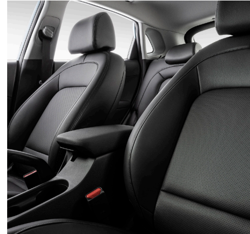
Artificial leather seats