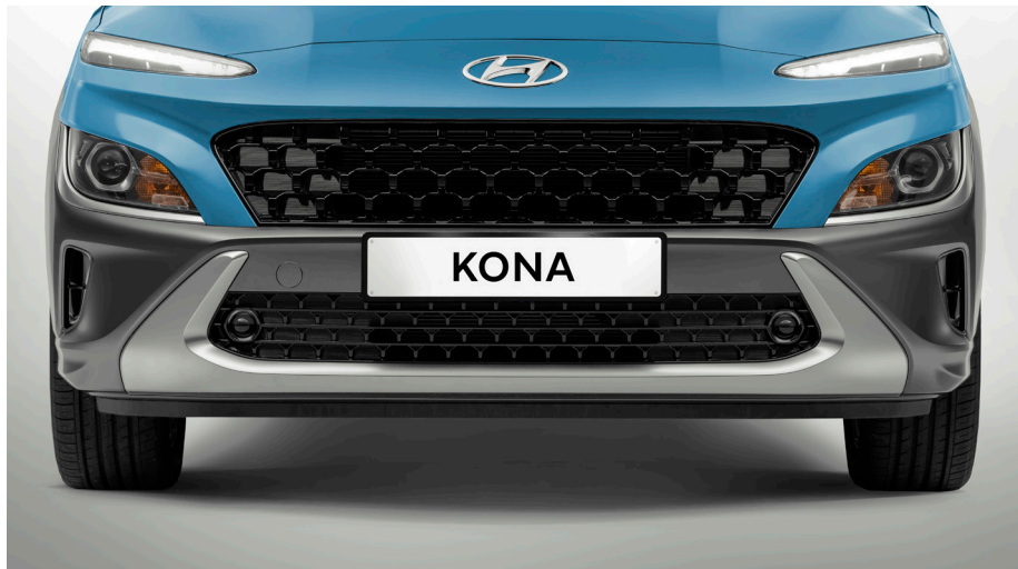
Sleek front grille