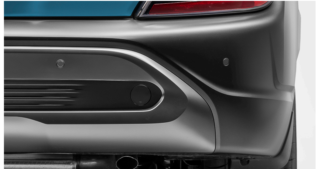
Rear parking sensors