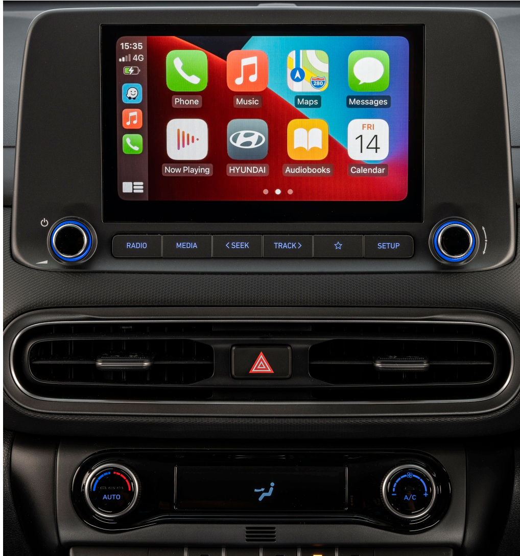
Apple carplay/android auto functionality

Unlock convenience with hassle-free keyless entry. So, get comfortable on your artificial leather seat trim, turn up your music and feel like a superstar with seamless Infotainment with Apple CarPlay and Android Auto. And while you enjoy expressions of freedom know that your car has your back with ESP and engine control intervention. Afterall, with freedom comes confidence in your car.