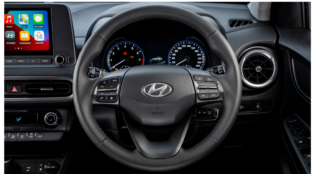
Steering wheel with multifunctional controls