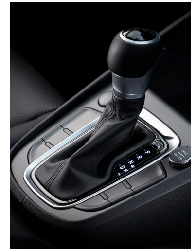
Gear knob with drive mode select