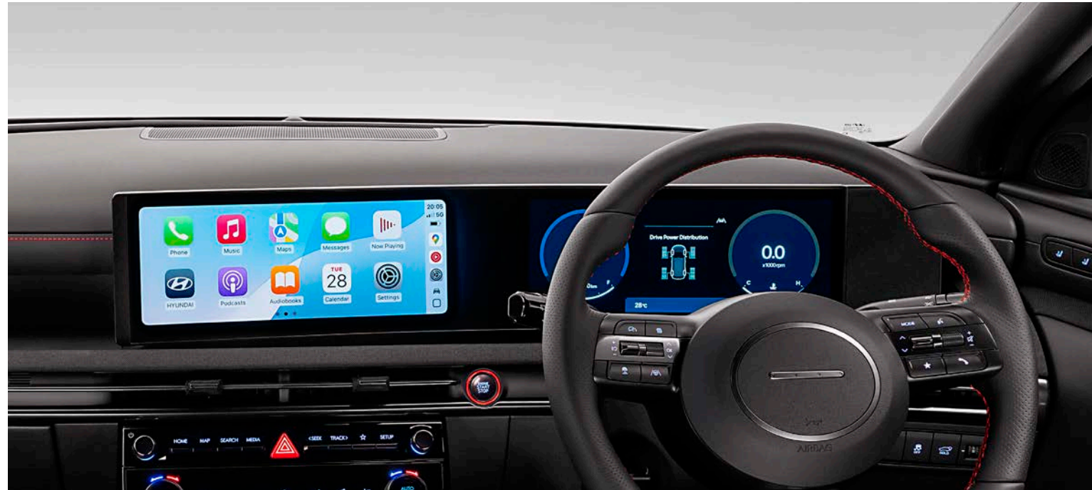
Integrated infotainment system