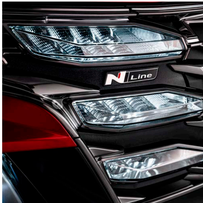
LED head lamps