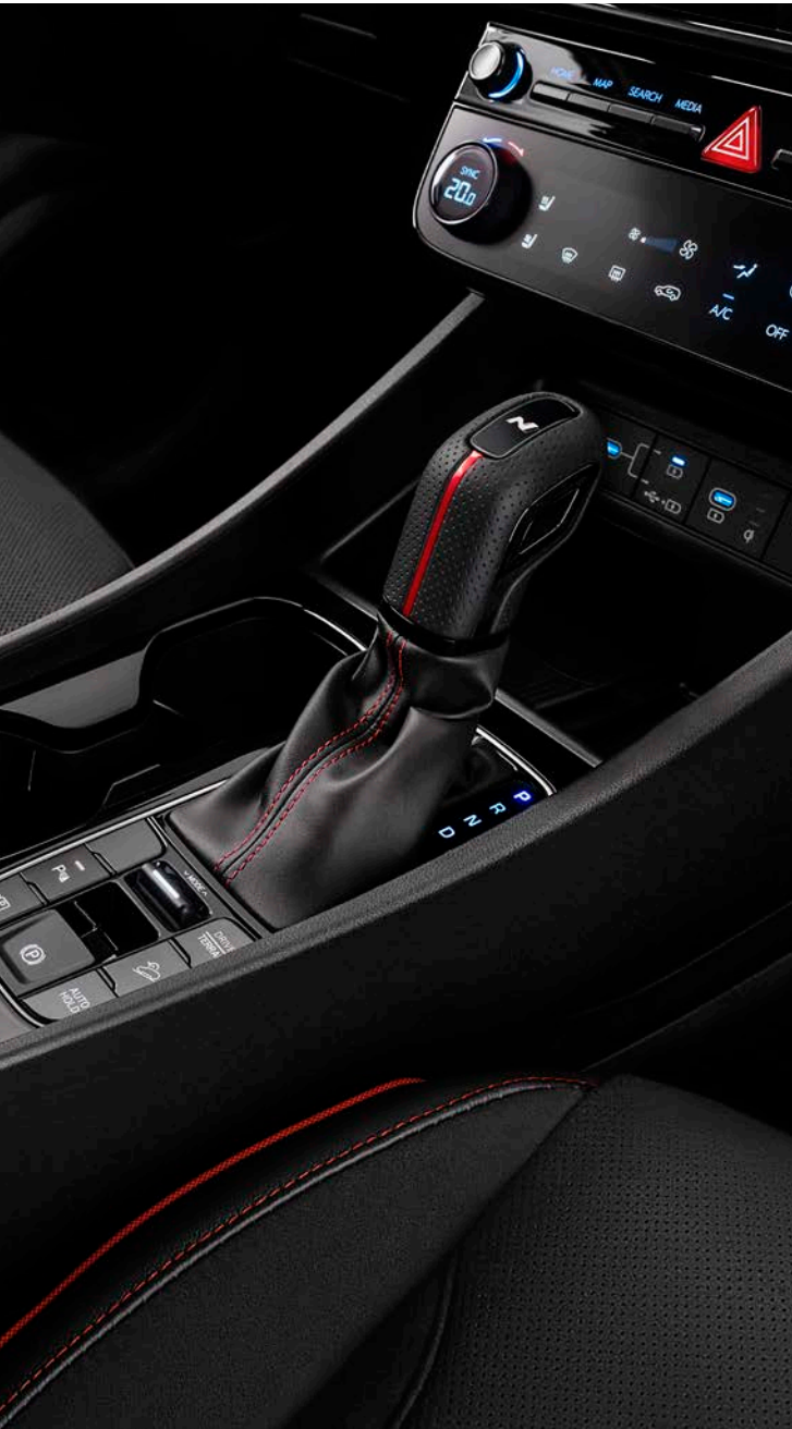
N Line leather with red stitching AT gear knob