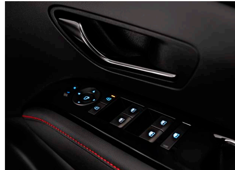
Electric window controls