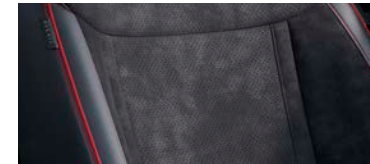
Artificial leather and suede with red stitching**

* Premium and Exec models only. ** N Line models only.