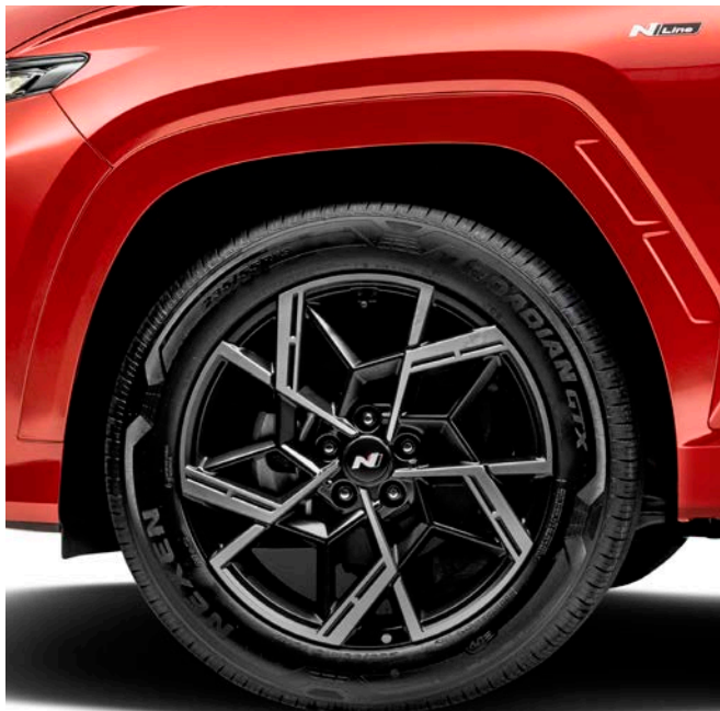
19" alloy wheels*