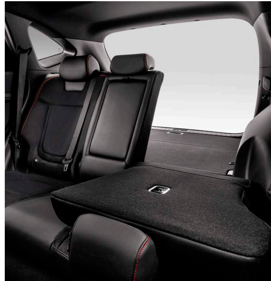
60/40 split rear seats