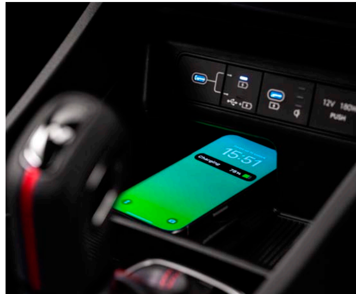
Wireless phone charging