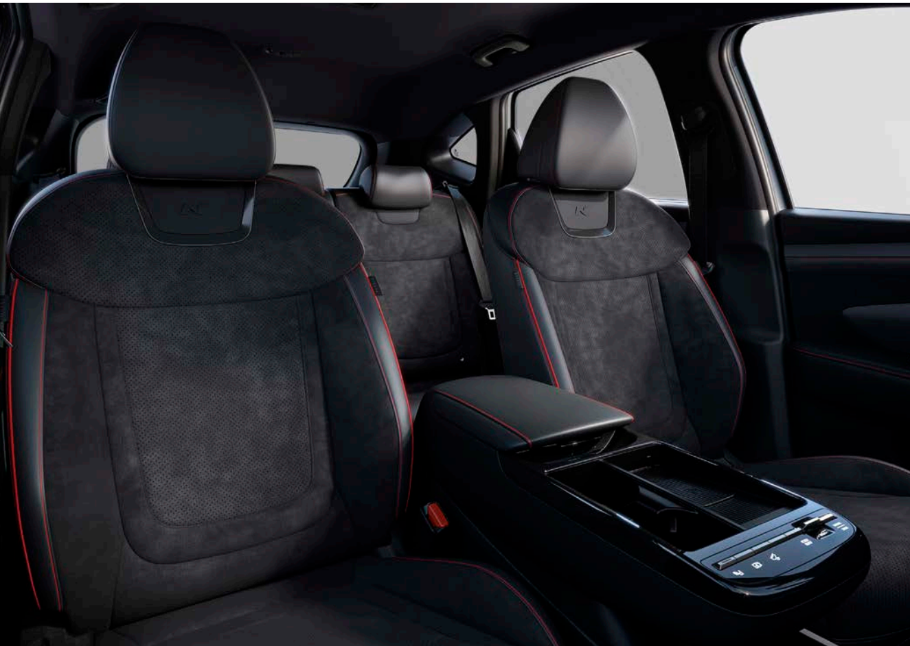
Artificial leather and suede seats**

*Exec and N Line models only. **N Line models only.