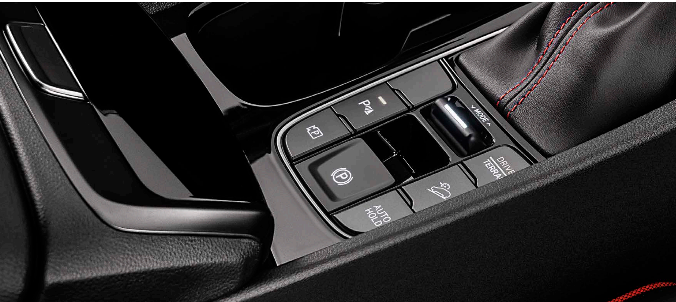
Parking brake with auto hold