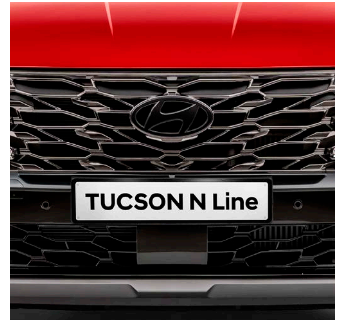
Glossy grille with black & dark chrome coating***